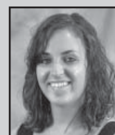
Jolie Helton Marketing